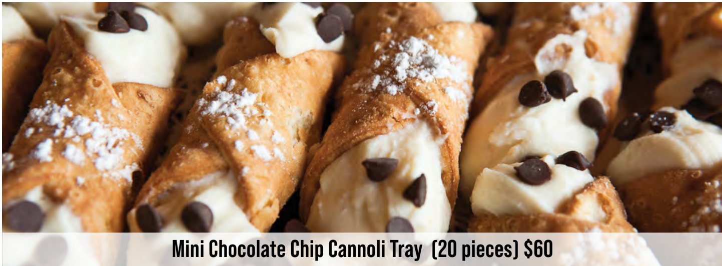
Mini Chocolate Chip Cannoli Tray (20 pieces) $60

Choice of Limoncello, Chocolate Fudge or Carrot Cake GF